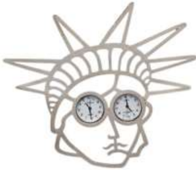
Liberty brooch fashioned for Dr. Albright from stainless steel and Swiss chronometers

The exhibit, which has been seen at several other sites, opened in Cedar Rapids on May 11 and will be there until October 27. Czechs all over the world take pride in the fact that our first female Secretary of State was born Madeleine Korbelová in Prague. She describes her family's escape to England as WWII loomed over Europe in her book Prague Winter . Another of her works is titled Read My Pins and relates many stories about her pins and their diplomatic ramifications.