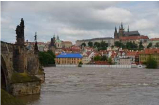
Prague Castle safe, Kampa in danger Kampa zastavěna povodnovými bariérami

In early June Prague braced for another huge flood in just over a decade. It's been 11 years since the horrible floods of 2002 that flooded the historic part of Prague - Kampa, Karlín, Prague's Metro system and many parts of Prague including the ZOO that was not able to evacuate all the animals on time. This year, the water brought damage as well, Prague suburbs on the river were flooded; part of the ZOO was under water again, but all the animals were transported to safety in time. The Metro was not damaged. The situation was much worse in many places throughout the country, not a single county in Bohemia was spared.