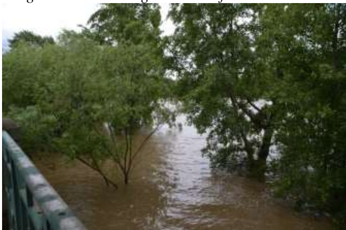
Prague embankment –popular walking path flooded