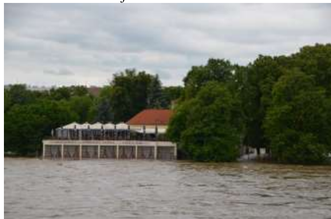
Střelecký Ostrov near National Theater