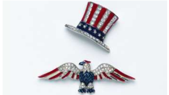
Uncle Sam hat and American eagle pin convey pride in the USA

additional way of expressing what I was saying, a visual way to deliver a message.” That snake pin is seen on the cover of her book and in the announcement of the exhibit in Cedar Rapids.