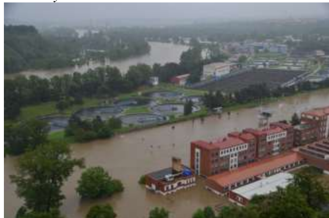
Flooded Prague 6, Zoo in the background