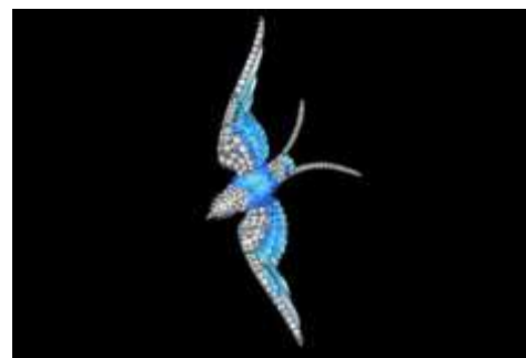
Bluebird pin, for good days

Dr. Albright also told Smithsonian about another of her forays into brooch-diplomacy. “I had an arrow pin that looked like a missile, and when we were negotiating the Anti-Ballistic Missile Treaty with the Russians, the Russian foreign minister asked, ‘Is that one of your missile interceptors you’re wearing? And I responded, ‘Yes. We make them very small. Let’s negotiate.’ Or, after we found that the Russians had planted a listening device—a ‘bug’—into a conference room near my office in the State Department, the next time I saw the Russians, I wore this huge bug. They got the message.” In Madeleine Albright’s view, non-verbal communication is, “complementary to the verbal. It’s an icebreaker, an opener.”