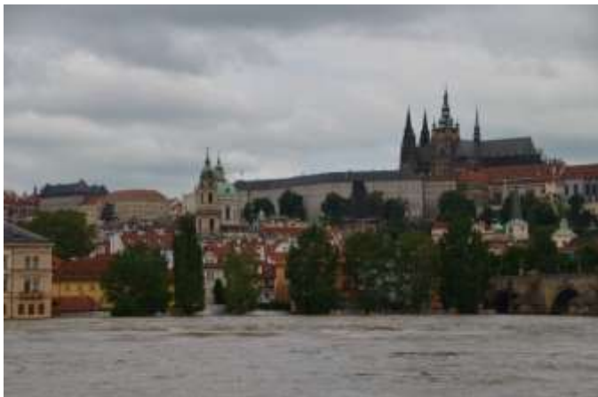
Prague resisted a large volume of water

The worst situation is in the north along the Labe (Elbe) River, especially at the confluence of the Vltava and Labe. Several villages were completely flooded, many lost access to surrounding towns. Thousands lost everything and will struggle with rebuilding and renovations for months to come. But an outpouring of material, financial help and volunteering brought the country together. If any of you would like to contribute to the flood relief, a Czech-based, foundation, known all over the world, People in Need (Člověk v tísni) established a flood relief account for payment from abroad: IBAN: CZ67 0300 0000 0000 7202 7202 , SWIFT: CEKOCZPP . If you need help with donation, or would like to donate through CSHA, contact Olga Mendel at omendel@gmail.com .