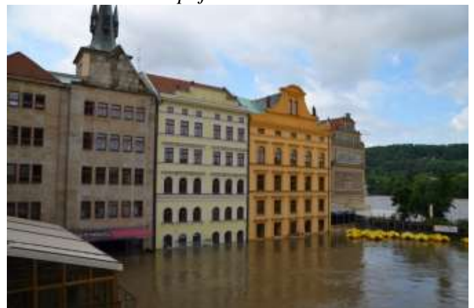
View from Charles Bridge