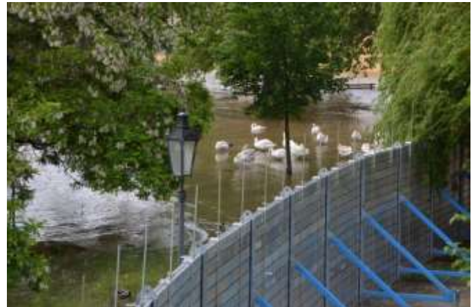
Malá Strana – Flood barriers and swans Vltava a labutě okupují Malou Stranu