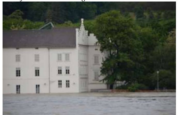
Kampa – flooded Sovovy mlýny – a museum