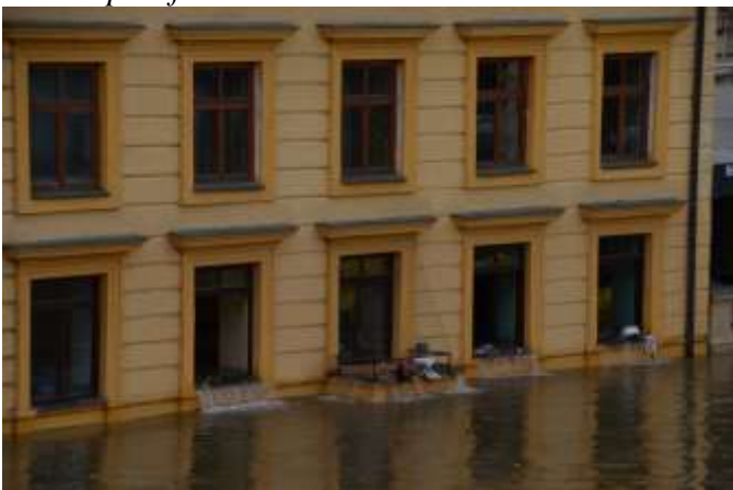
Novotného Lávk – flooded bars and music clubs