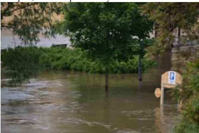
At Kampa - flooded