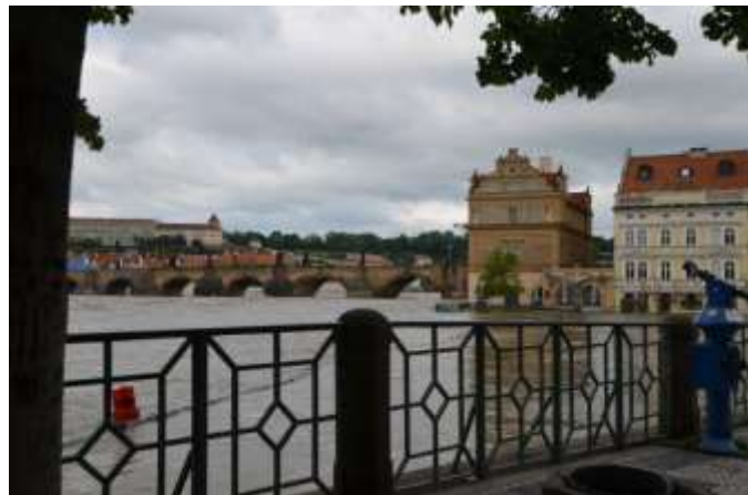
Novotného lávka - flooded