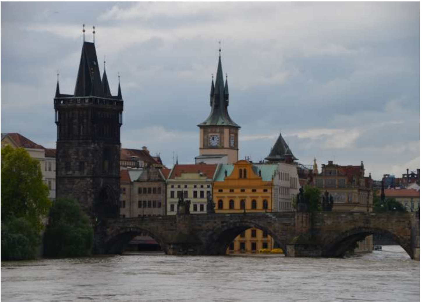
Flooded City of Prague in early June 2013

A publication of the Czech and Slovak Heritage Association of Maryland